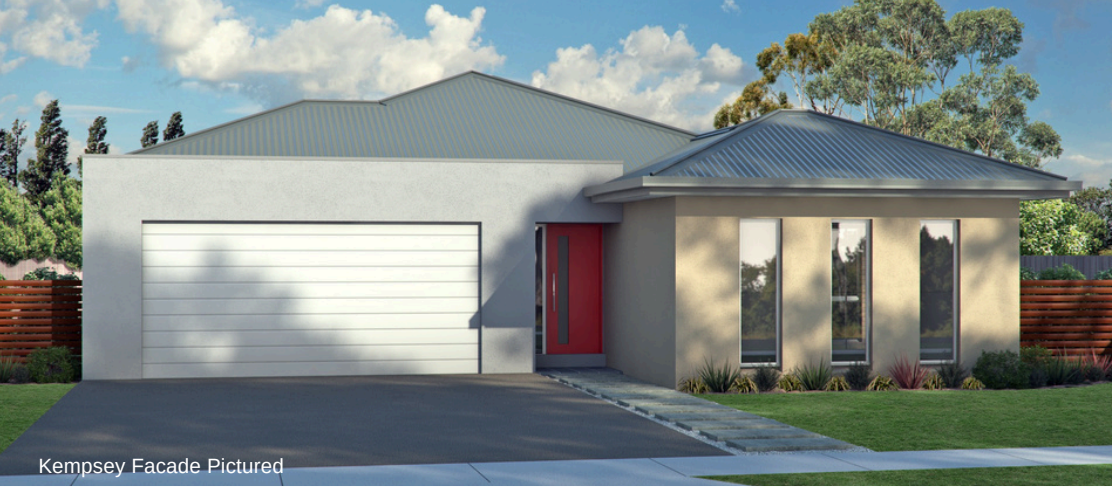
Kempsey Facade Pictured