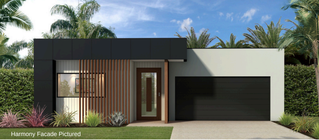
Harmony Facade Pictured