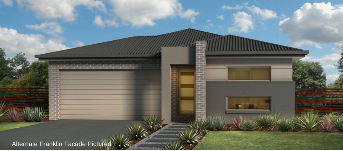
Alternate Franklin Facade Pictured