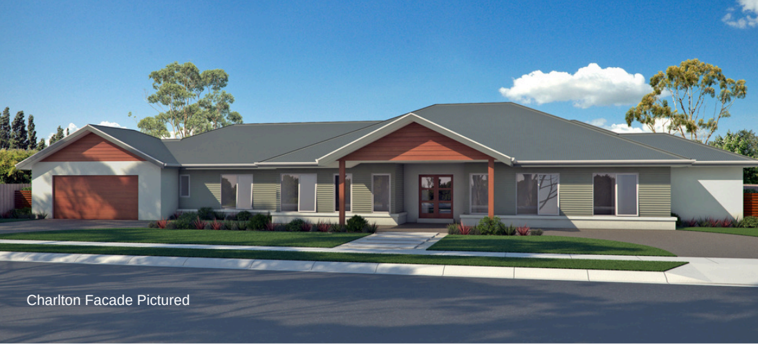
Charlton Facade Pictured