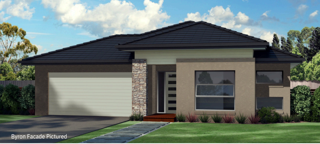
Byron Facade Pictured