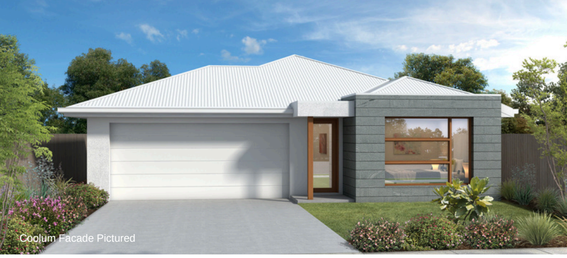
Coolum Facade Pictured