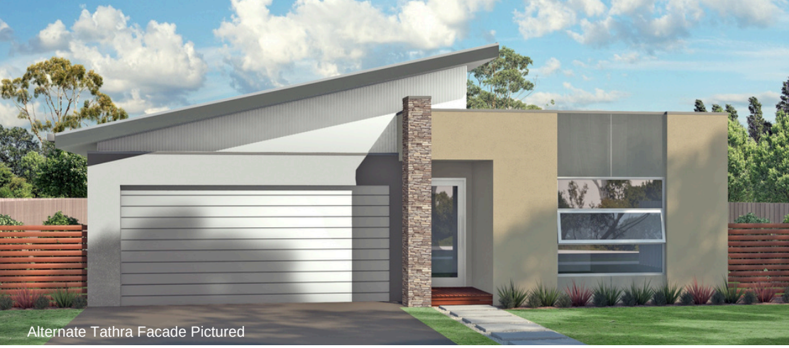
Alternate Tathra Facade Pictured